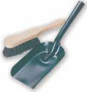
Browns Fire Brush & Shovel Set 324032