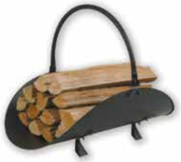
Nouveau Log Holder With Handle 366517

Mitre 10 MEGA Westgate & Henderson Northside Drive & Lincoln Road Monday - Friday: 7am - 7pm Weekends: 7am - 7pm