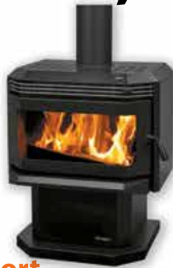
Masport Hestia 2 Fireplace 321155