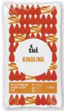
Tui Bagged Kindling 297168